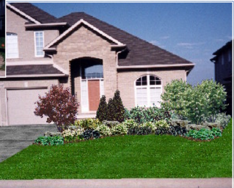
Computer-Assisted Design Technology