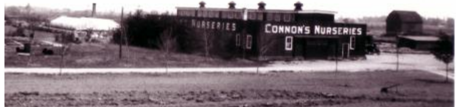
Connon Nurseries 1906