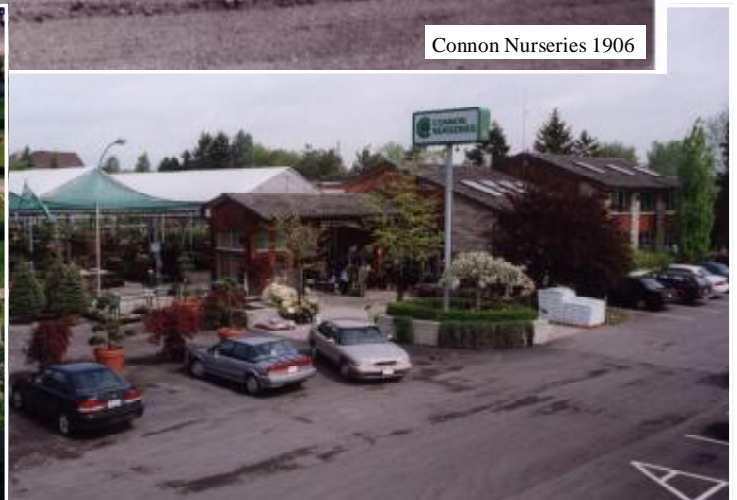
Connon Nurseries, Waterdown 2006