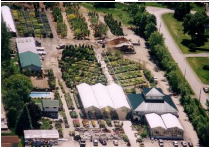
Connon Nurseries, Trenton 2006