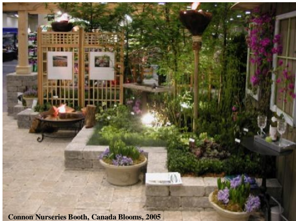
Connon Nurseries Booth, Canada Blooms, 2005

656 Robson Road Waterdown, Ontario L0R 2H0 Tel: (905) 689-7433 Fax: (905) 689-4900